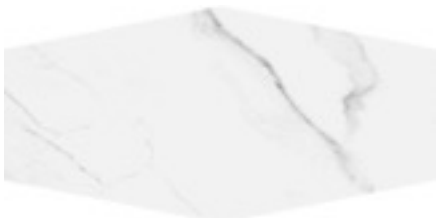
LUXURY STONE STATUARIO