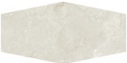
LUXURY STONE MARFIL